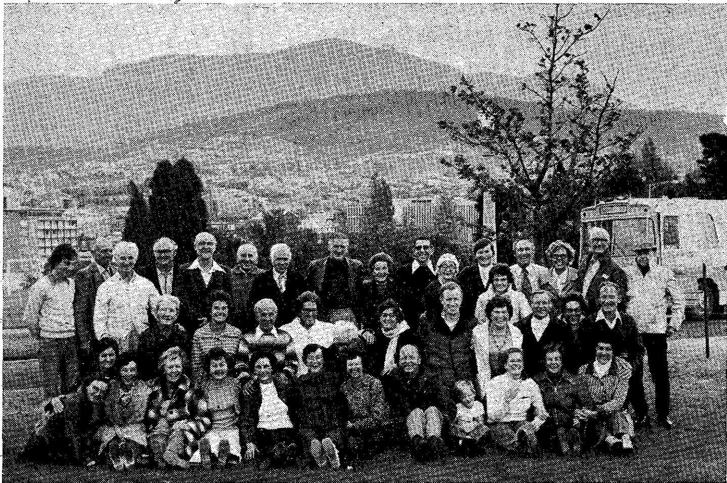
N.S.W. Dancers and their "small one" Tour of Tasmania 1976