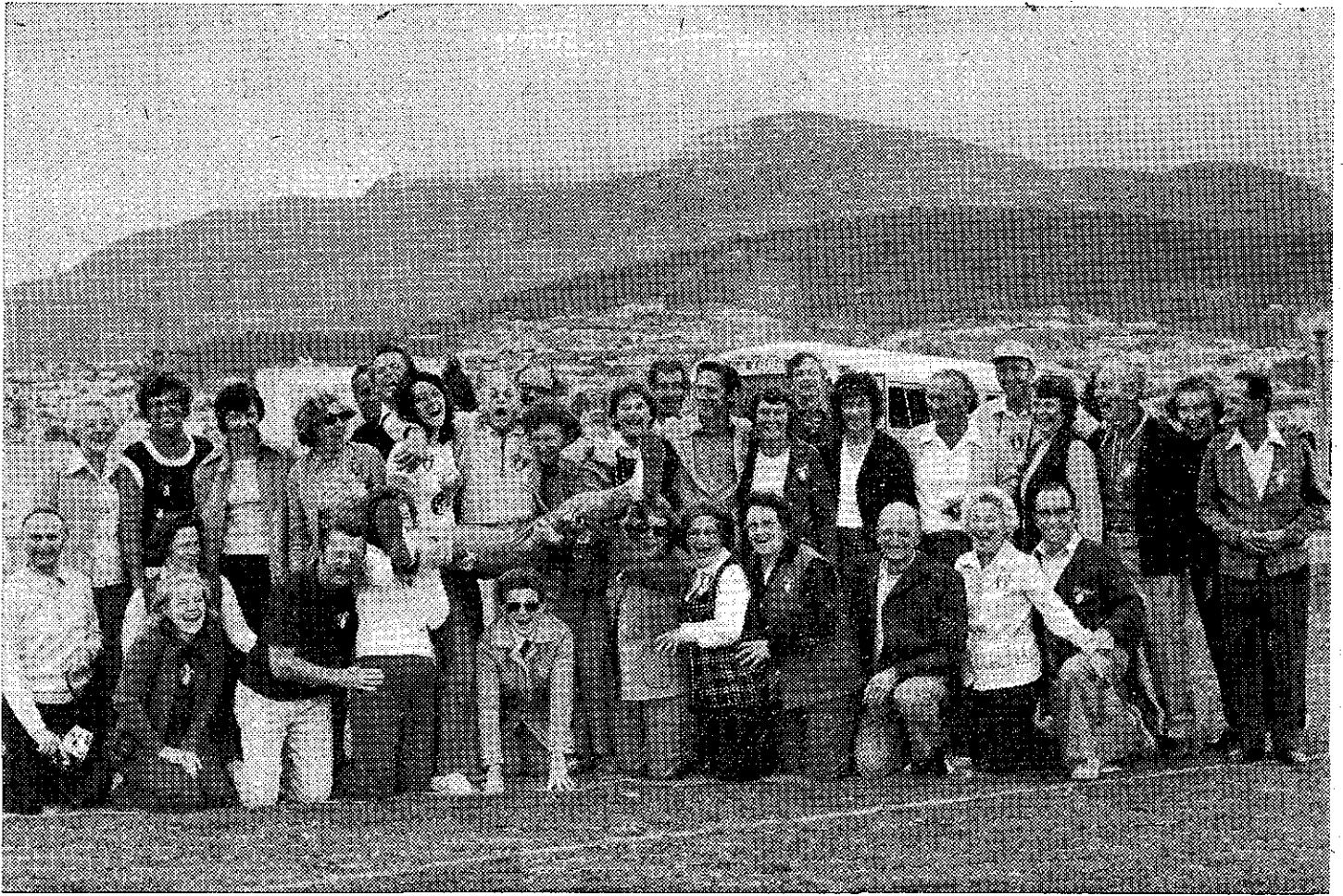
This photo depicts the happy faces of dancers on tour, Tassie 1976.